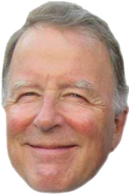
I wish we had more meetings in person