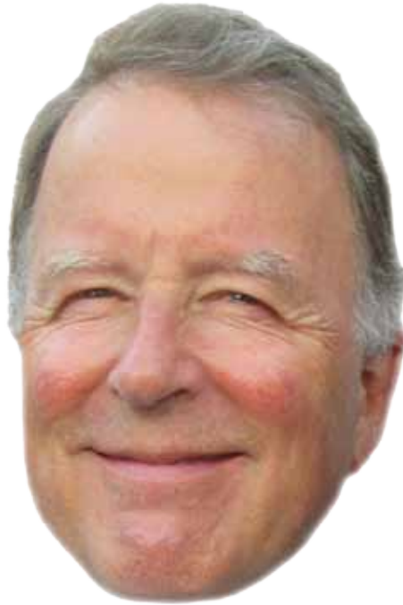
I wish I could still continue on as President... NOT!