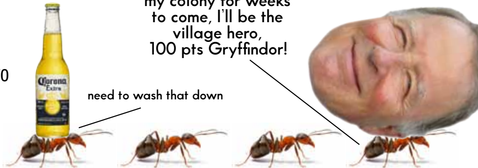
need to wash that down

This head will feed my colony for weeks to come, I'll be the village hero, 100 pts Gryffindor!